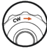
Adjustment direction CW