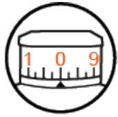
TWIST GUARD windage EasyRead elevation turret