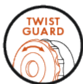
TWIST GUARD windage