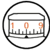
EasyRead elevation turret