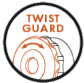
TWIST GUARD windage