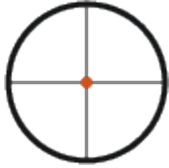
1st focal plane