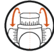
Windage left or right