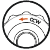
Adjustment direction CCW