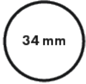
Main tube 34 mm