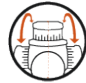
Windage left or right