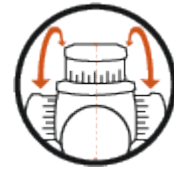
Windage left or right