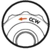
Adjustment direction CCW