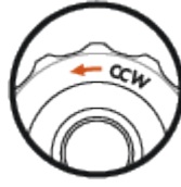
Adjustment direction CCW