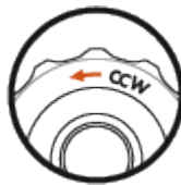
Adjustment direction CCW