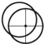
2nd focal plane