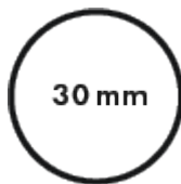
Main tube 30 mm