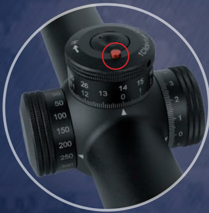
Reticle placement indicator