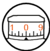
EasyRead elevation turret