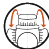
Windage left or right