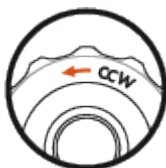
Adjustment direction CCW