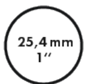
Main tube 25.4 mm